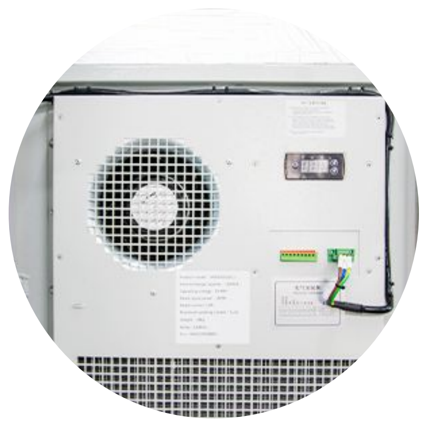
heat exchange / air conditioner