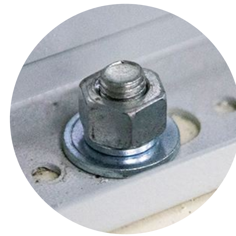
HEX head stainless steel anti-theft screw