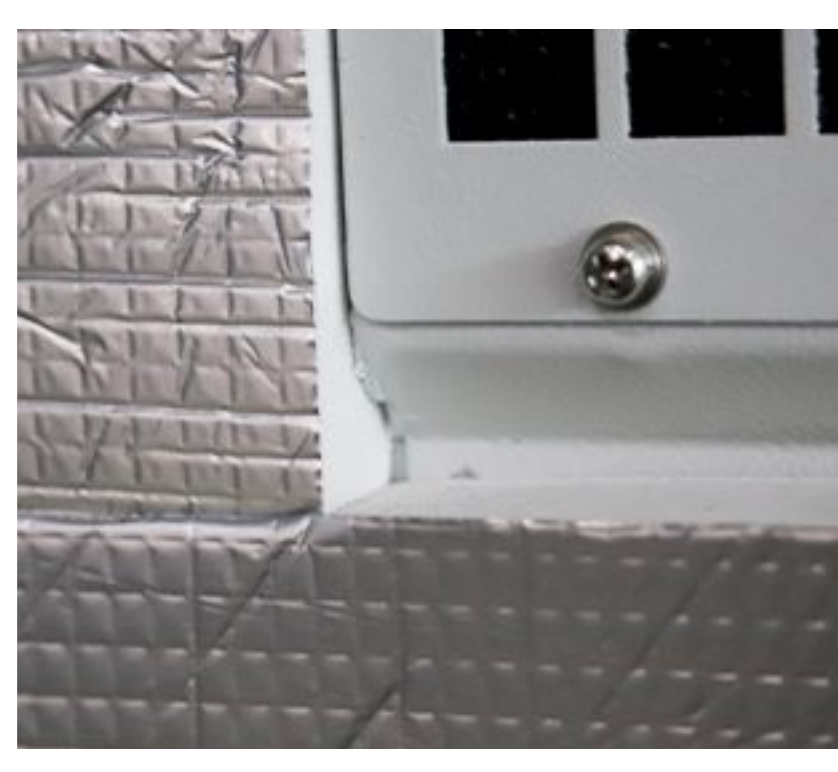
heat insulation foam