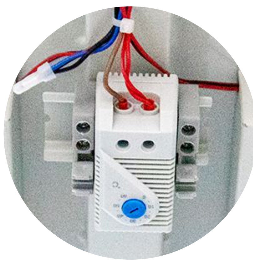
fan module controller