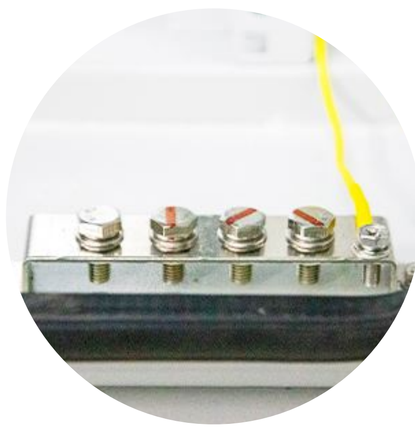
ground copper bar